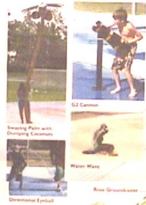
Swaying Palm with Dumping Coconuts