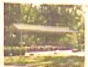
Alternate Picnic Area - Shade Canopy - Tables (8 persons)