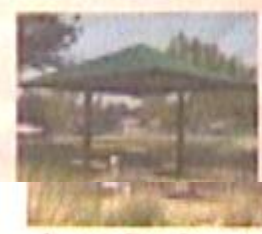
Alternate Shade Structures